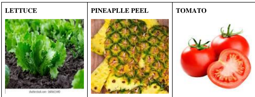
Figure 1: Pictures of the Agricultural Residues Utilized in the Digestion Process.