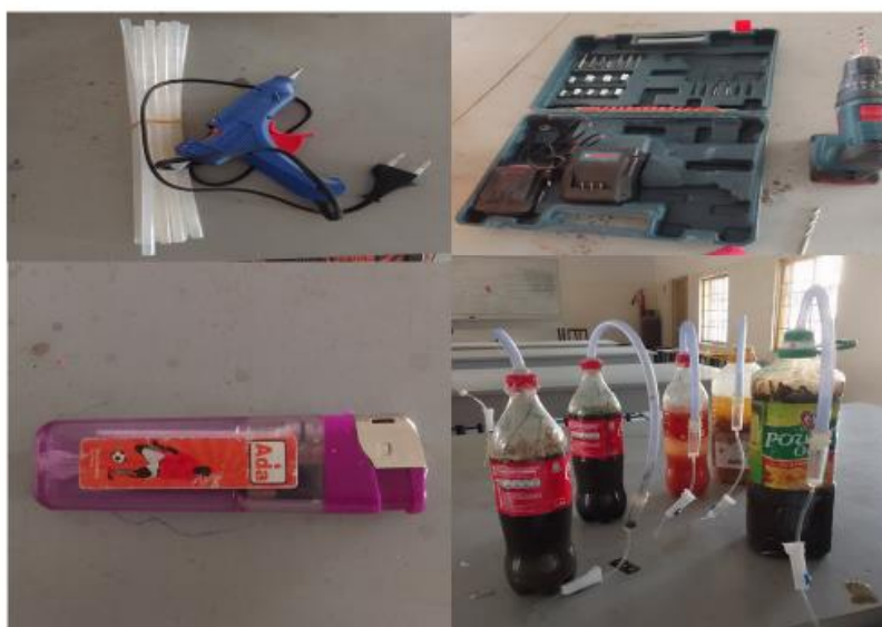
Figure 2: A Set-up for the Bio-digestion

Daily pressure measurements were recorded throughout the entire hydraulic retention period designated for the study.