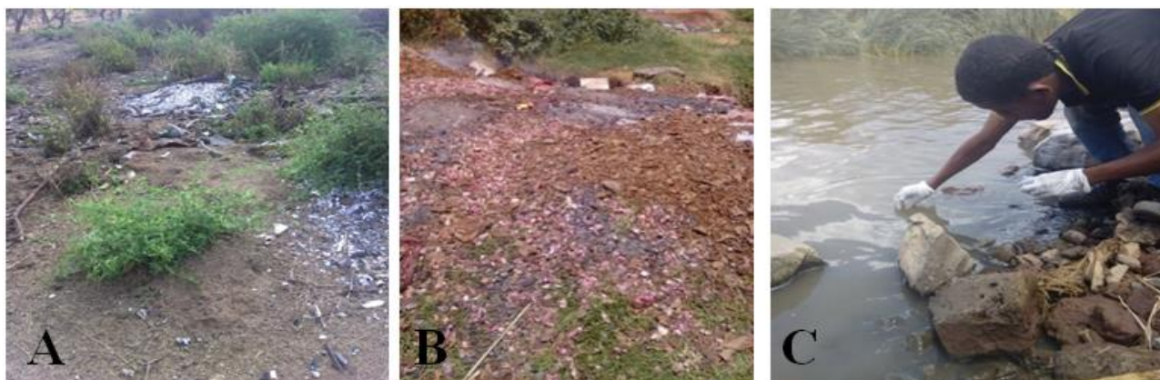
Figure 1 Sample collected Area: (A) abattoir waste disposal; (B) Abaya campus cafeteria waste and (C) Lake Chamo