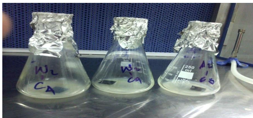
Figure 3: West X-ray in immersed in 10 ml of crude enzyme during gelatine hydrolysis

The crude enzymes were produced from ten potential bacterial strains under submerged condition. Culture filtrates were separated by centrifugation at 5000 rpm for 15 min and the supernatants were used as crude enzyme source for gelatin hydrolysis and for silver recovery (fig 3). Cell pellet was discarded.