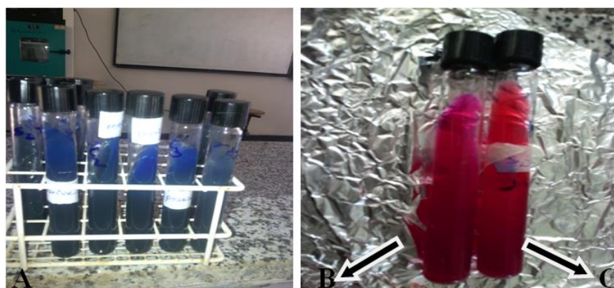
Figure 2: Result of some biochemical tests: (A) Positive citrate utilization test; (B) positive urease test and (C) negative urease test result

Key: +++ (highly positive); ++ (medium positive); +(positive); - (negative), Ab (Abattoir), Ac (Abaya campus), W (water), C n (colonies number)