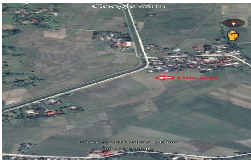
Figure 2. Map of the Philippines, Showing the Locale of the Study.

During the study period, maximum temperature ranged from 20.60 °C to 34. 90 °C and the minimum temperature ranged from 19.60 °C to 30.25 °C (Fig.4).The maximum temperature of 34. 90 °C occurred on July 21, when the plants were at vegetative stage and lowest temperature of 19.0 °C occurred on September 25 when the plants were at early reproductive stage.