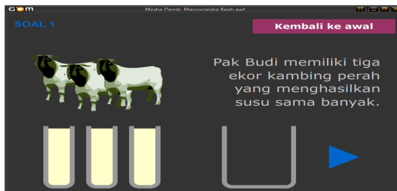
Figure 1: Illustration of flash player (video) in the image form

Library panel has a function as a symbol/media library that used in animations that are being made. Symbol is collection of picture and movie, button, sound, and static image. One of flash player (video) that made as in the image below: